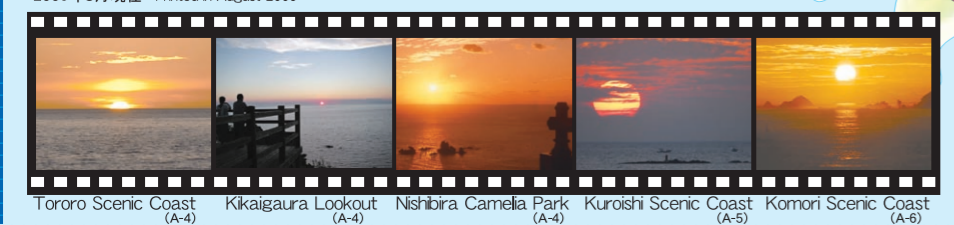
Tororo Scenic Coast (A-4) Kikagaura Lookout (A-4) Nishibira Camella Park (A-4) Kuroshi Scenic Coast (A-5) Komori Scenic Coast (A-6)

Treasure Islands Amakusa Tourism Association http://www.t-island.jp 15-7 Chuo-Shimachi, Amakusa City, Kumamoto Pref. 863-0023 phone: 0969-22-2243 fax: 0969-22-2390 Business hours: 9 AM-6 PM daily except for New Year Holidays